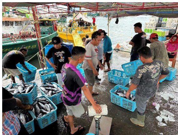
Tumumpa Fishing Port, Manado, Sulawesi